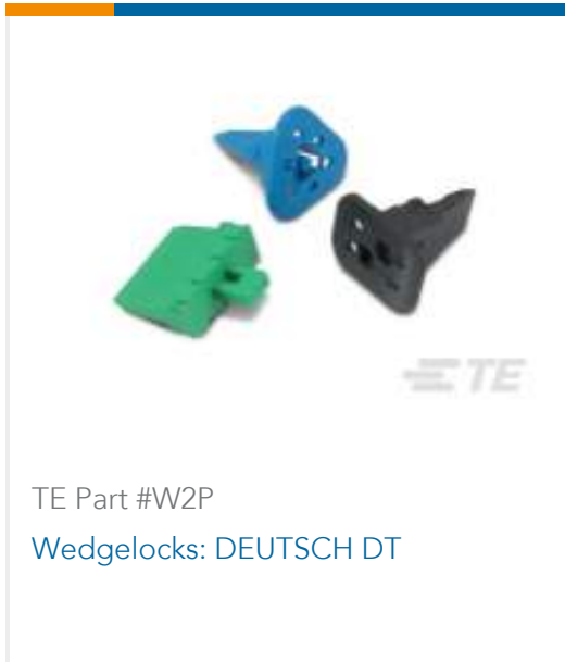
TE Part #W2P Wedgelocks: DEUTSCH DT