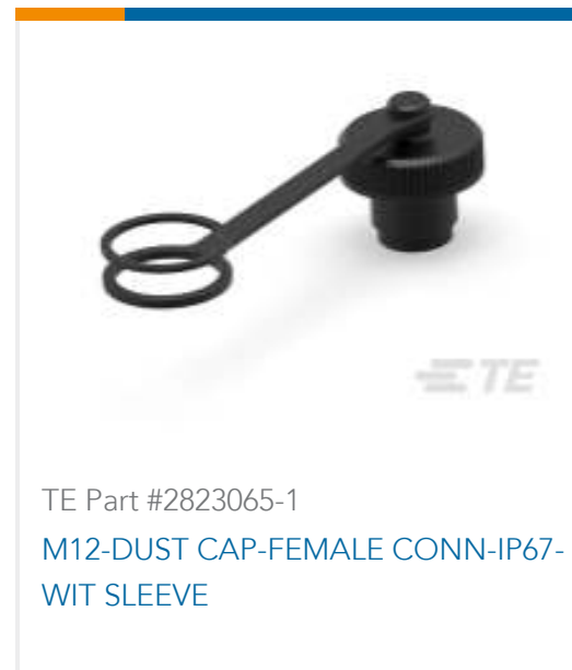
TE Part #2823065-1 M12-DUST CAP-FEMALE CONN-IP67- WIT SLEEVE