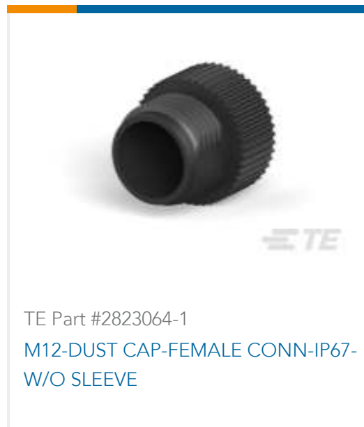
TE Part #2823064-1 M12-DUST CAP-FEMALE CONN-IP67- W/O SLEEVE