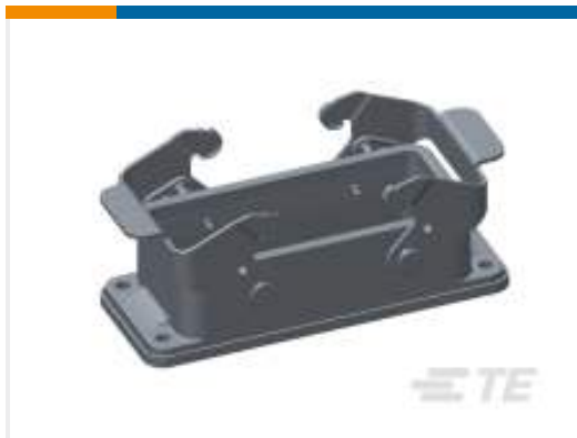
TE Part #T1410162000-000 H16B-AG