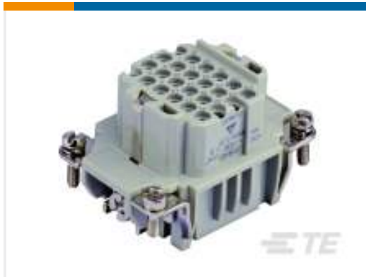
TE Part #T2030242201-000 HDD-024-F