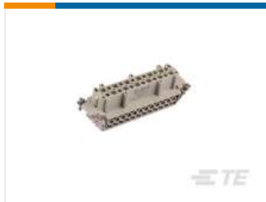
TE Part #T2040242201-000 HE-024-F