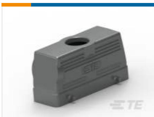
TE Part #T1220240121-000 H24B-TG-PG21