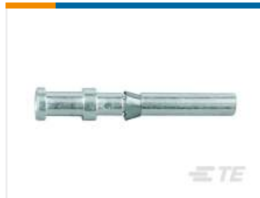
TE Part #T2020002015-000 CDF-1.5