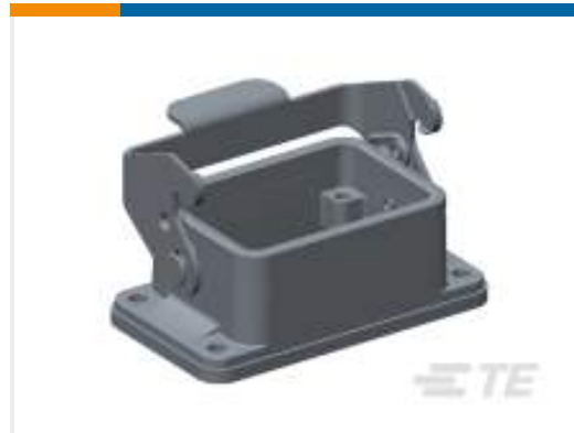
TE Part #T1500063000-000 H6B-AG