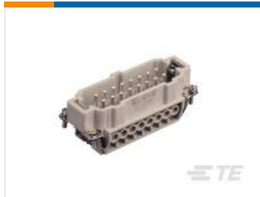
TE Part #T2040162101-000 HE-016-M