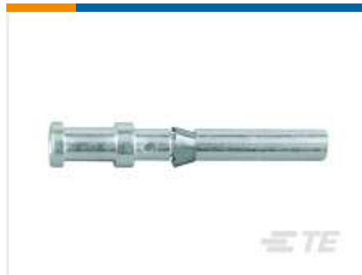
TE Part #T2020002008-000 CDF-0.75