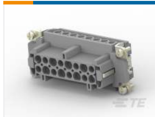
TE Part #T2040162201-000 HE-016-F