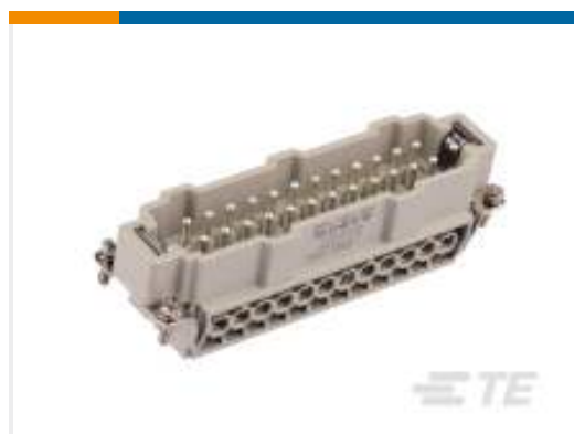
TE Part #T2040242101-000 HE-024-M