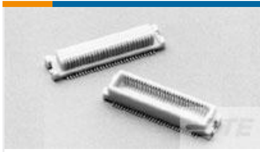
TE Part #5-1747022-3 ON TAPING(EMBOSS) 0.5MM PITCH