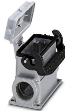
Photo shows product without screw connection

http://eshop.phoenixcontact.de/phoenix/treeViewClick.do?UID=1771189