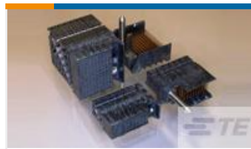
TE Part # 2132569-2 IMP100O,HMP,V3P6C,LG,OEW46,5.5