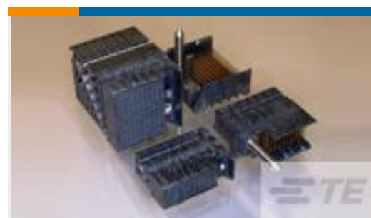
TE Part # 2132561-2 IMP100O,HMP,V3P6C,LG,OEW39,5,5