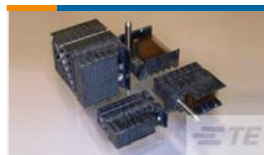
TE Part # 2132562-1 IMP100O,HMP,V3P6C,LG,REW39,4,9