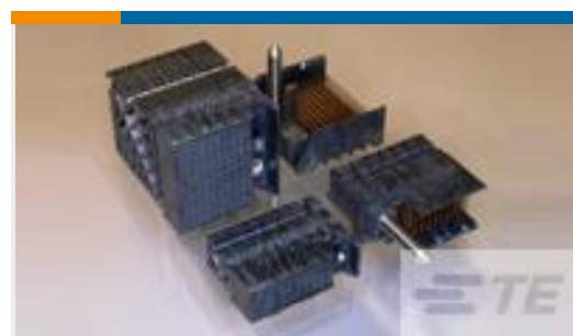
TE Part # 2132563-1 IMP100O,HMP,V3P6C,RG,OEW39,4,9