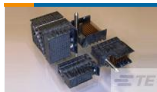
TE Part # 2132564-1 IMP100O,HMP,V3P6C,RG,LEW39,4,9