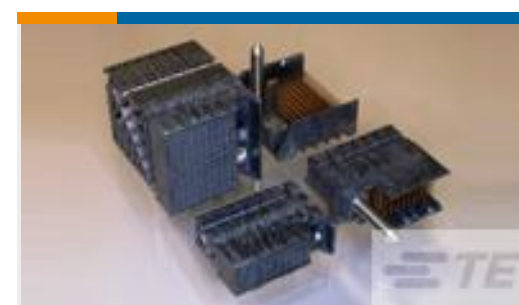
TE Part # 2132568-2 IMP100O,HMP,V3P6C,UG,REW39,5,5