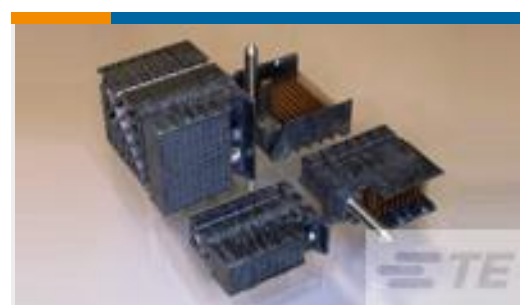
TE Part # 2132567-2 IMP100O,HMP,V3P6C,UG,DEW39,5,5