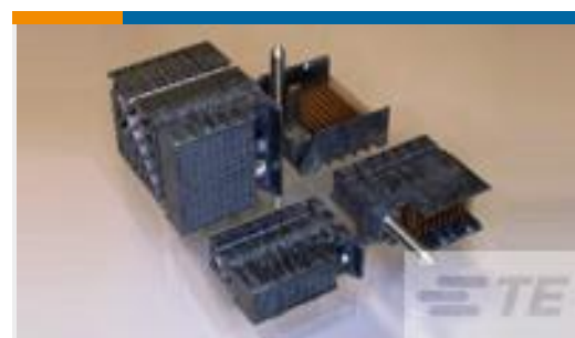
TE Part # 2132563-2 IMP100O,HMP,V3P6C,RG,OEW39,5,5