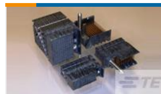
TE Part # 2132562-2 IMP100O,HMP,V3P6C,LG,REW39,5,5