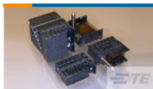
TE Part # 2132565-1 IMP100O,HMP,V3P6C,UG,OEW39,4,9