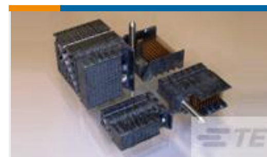
TE Part # 2132564-2 IMP100O,HMP,V3P6C,RG,LEW39,5,5