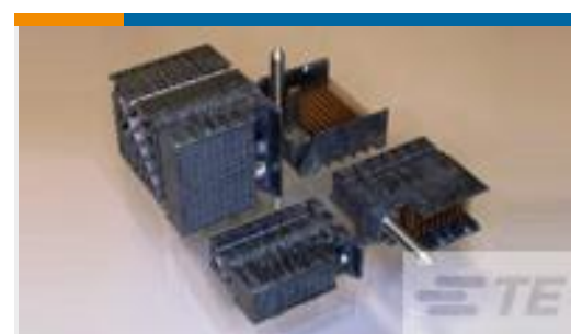
TE Part # 2132568-1 IMP100O,HMP,V3P6C,UG,REW39,4,9