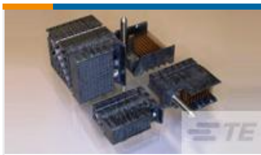
TE Part # 2132570-1 IMP100O,HMP,V3P6C,LG,REW46,4.9