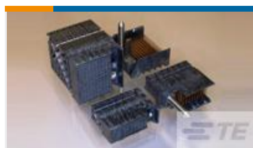
TE Part # 2132567-1 IMP100O,HMP,V3P6C,UG,DEW39,4,9