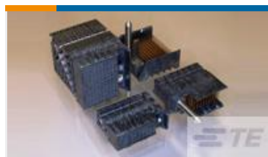
TE Part # 2132561-1 IMP100O,HMP,V3P6C,LG,OEW39,4,9