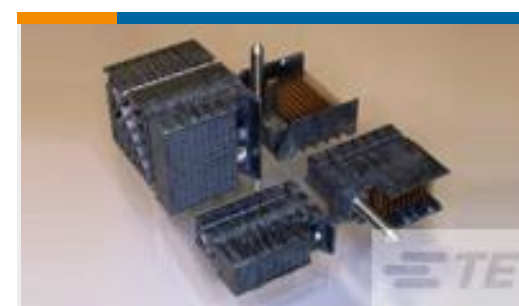
TE Part # 2132566-2 IMP100O,HMP,V3P6C,UG,LEW39,5,5