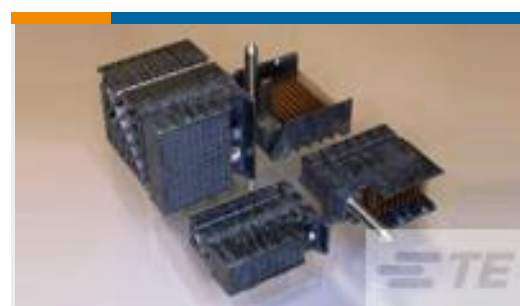
TE Part # 2132565-2 IMP100O,HMP,V3P6C,UG,OEW39,5,5