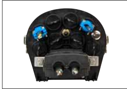
3M™ Fiber Dome Terminal Closure FDTC 08M and FDTC 08S Direct Splice Drop Termination Port Layout