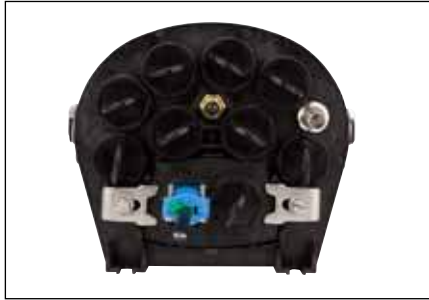
3M™ Fiber Dome Terminal Closure FDTC 08ME Direct Splice Drop Termination Port Layout

Each drop has a separate seal (grommet and O-ring), strain-relief bracket, and strength member retention lug.