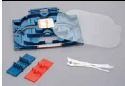
3M™ Fiber Optic Splice Tray 2540-12-SF/72-MF