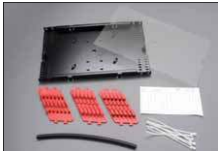
3M™ Fiber Optic Splice Tray 2538