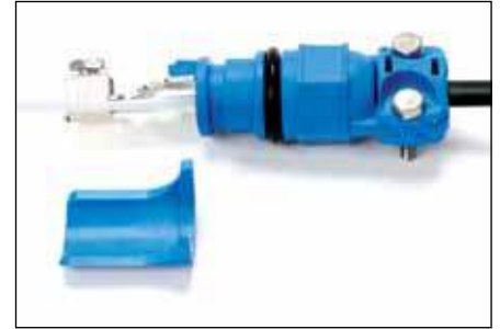
3M™ 12 mm External Cable Assembly Module (ECAM) Cable Entry Port