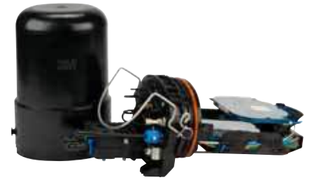
3M™ Fiber Dome Terminal Closure FDTC 08M Direct Splice Drop Termination

The fiber dome terminal closures FDTC 08M and FDTC 08S utilize the 3M External Cable Assembly Module (ECAM) built-in drop entry port system. The ECAM design allows true plug-and-play capability which may reduce installation and labor costs because the drop preparation is completed outside of the terminal closure body. Also, the built-in drop entry system allows the technician to add and remove drops without disturbing previously installed drops. The terminal closures FDTC 08M and FDTC 08S are Rural Development (RUS) Listed.