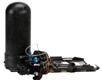
3M™ Fiber Dome Terminal Closure FDTC 08S Direct Splice Drop Termination