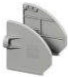
Flange cover, Color: gray