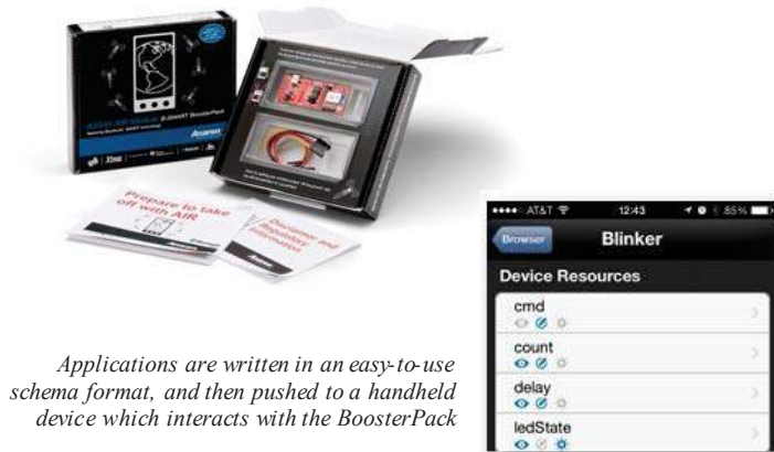
Applications are written in an easy-to-use schema format, and then pushed to a handheld device which interacts with the BoosterPack

Industrial controls and monitoring, remote controls, home/building automation, lighting systems, low power wireless sensor networks, and consumer electronics, sports monitoring, health & wellness, among many others