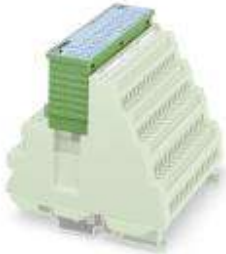
Replacement module electronics for IB ST (ZF) 24 AO 4/BP

Please be informed that the data shown in this PDF Document is generated from our Online Catalog. Please find the complete data in the user's documentation. Our General Terms of Use for Downloads are valid ( http://phoenixcontact.com/download )