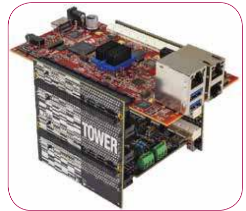
Figure 1. TWR-LS1021A module (TWR-LS1021A, TWR-SER-IO and TWR-ELEV)