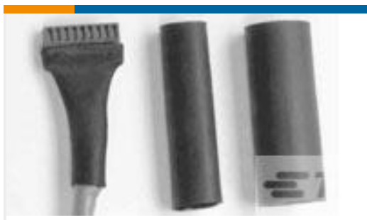
TE Part #7580142002 DWP-125-3/8-0-STK