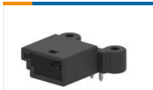
TE Part #1-1418773-1 Signal Header