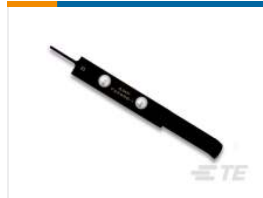
TE Part # 723986-1 EXTRACTION TOOL