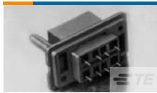
TE Part #172063-1 08P DRAWER MALE HSG