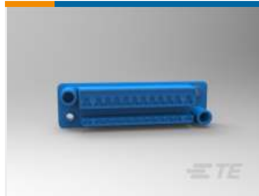
TE Part # CAT-AM7017-SD292P Standard Drawer Plug Housings