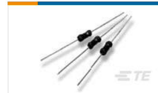
TE Part #6-1625890-4 2W SM M/OX 5% 680R