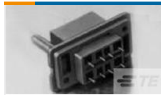
TE Part #5172070-1 DRAWER CONN. FEMALE HSG ASSY 8