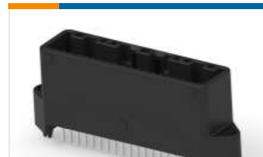
TE Part #2237023-1 40P 025 CAP ASSY