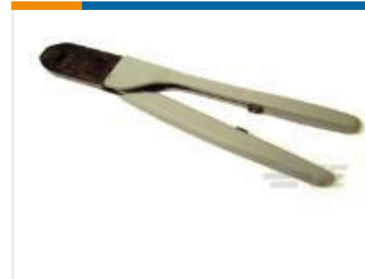
TE Part # 91590-1 CCII DRAWER CONNECTOR 20-16 ASSY