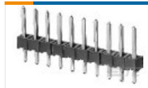
TE Part #5-146274-4 04 MODII HDR SRST B/A .100CL