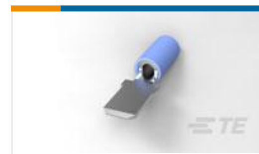
TE Part #66024-6 TAB,PIDG TERMI-BK 16-14