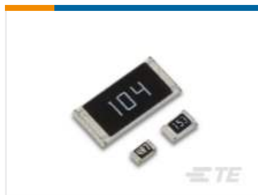
TE Part #4-2176341-9 CRGCQ 0805 100K 1%