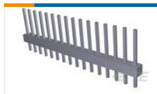
TE Part #6-146276-6 16 MODII HDR SRST B/A .100CL