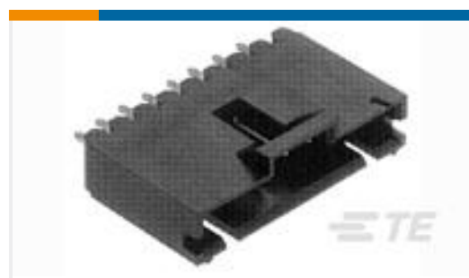
TE Part #5-103639-1 02 MTE HDR SRST LATCH .100CL