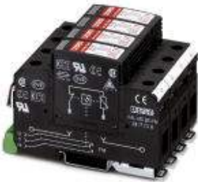
Surge protection combination type 2 for 500 V AC and 690 V AC in an IT system (without neutral conductor)

Please be informed that the data shown in this PDF Document is generated from our Online Catalog. Please find the complete data in the user's documentation. Our General Terms of Use for Downloads are valid ( http://phoenixcontact.com/download )