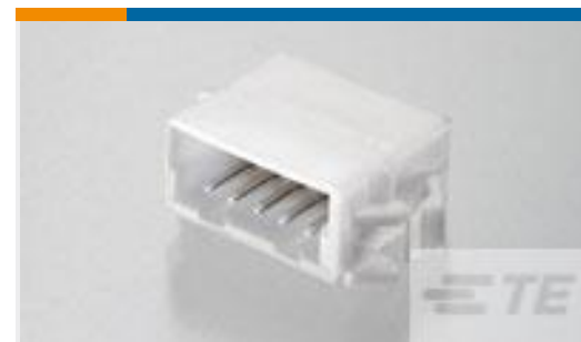
TE Part #1-292254-0 CT RELAY HDR ASSY 10P NAT