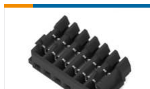
TE Part #2-353293-6 1.5MM CT MT REC ASS'Y 6P BLACK