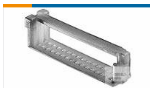
TE Part #3-353294-4 AMP MINI D/R HDR HSG 34P NATU