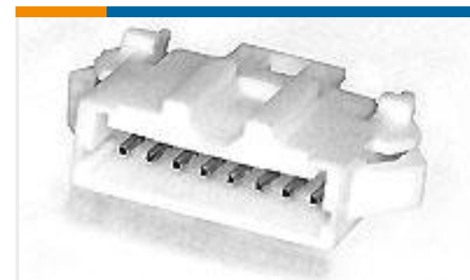
TE Part #1-292215-0 MINI CT SGL RELAY 10P NAT