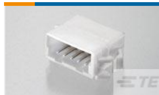
TE Part #292254-5 CT RELAY HDR ASSY 5P NAT