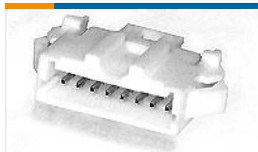
TE Part #1-292215-7 MINI CT SGL RELAY 17P NAT