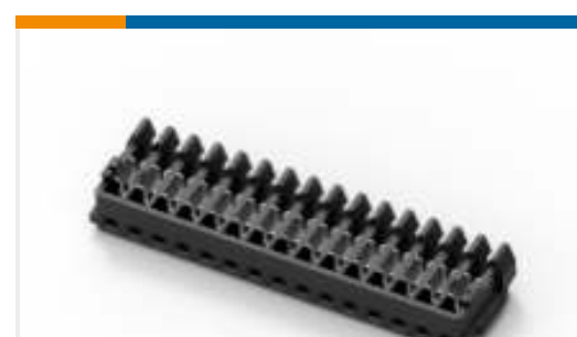
TE Part #3-353293-5 1.5MM CT MT REC ASSY 15P BLACK