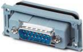
D-SUB panel mounting frame, shell size 2, with 15 signal contacts, pin, gender changer, shielded, IP67 degree of protection

Please be informed that the data shown in this PDF Document is generated from our Online Catalog. Please find the complete data in the user's documentation. Our General Terms of Use for Downloads are valid ( http://phoenixcontact.com/download )