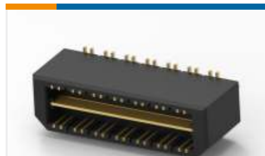
TE Part # 7-1658014-1 MSB0.80PL8ASY28DP,GP,10,VCTR