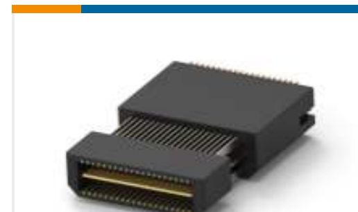
TE Part # 7-1658016-1 MSB0.80PL16ASY28DP,GP,10,VCTR