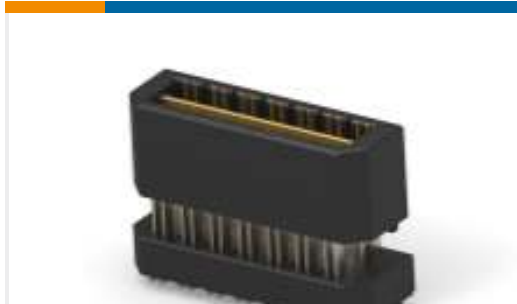
TE Part # 7-1658438-1 MSB0.80PL14ASY28DP,GP,10,VCTR