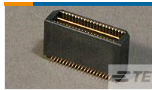
TE Part # 7-1658015-1 MSB0.80PL11ASY28DP,GP,10,VCTR