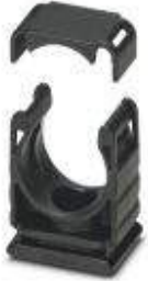
Hose holder with cover

Please be informed that the data shown in this PDF Document is generated from our Online Catalog. Please find the complete data in the user's documentation. Our General Terms of Use for Downloads are valid ( http://phoenixcontact.com/download )