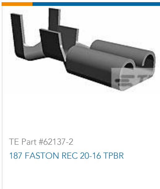
TE Part #62137-2 187 FASTON REC 20-16 TPBR