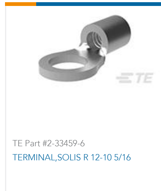
TE Part #2-33459-6 TERMINAL,SOLIS R 12-10 5/16