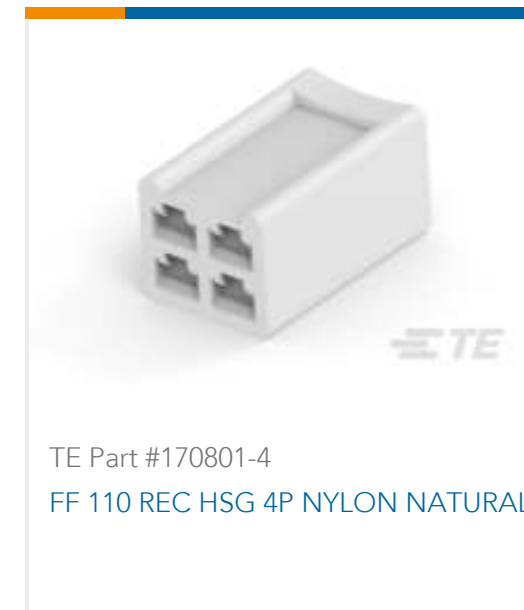
TE Part #170801-4 FF 110 REC HSG 4P NYLON NATURAL