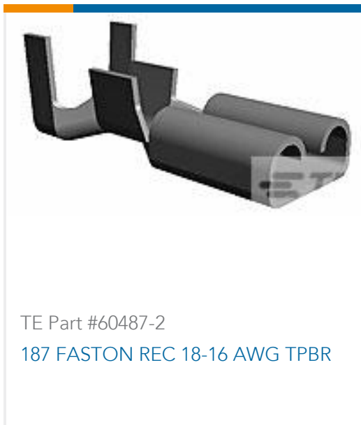
TE Part #60487-2 187 FASTON REC 18-16 AWG TPBR