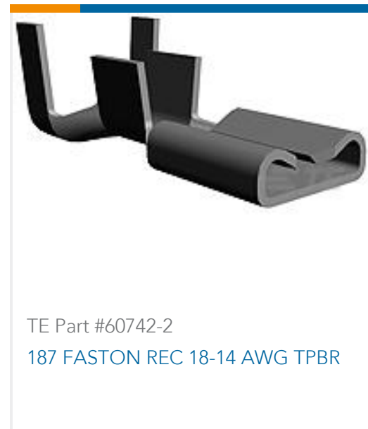
TE Part #60742-2 187 FASTON REC 18-14 AWG TPBR