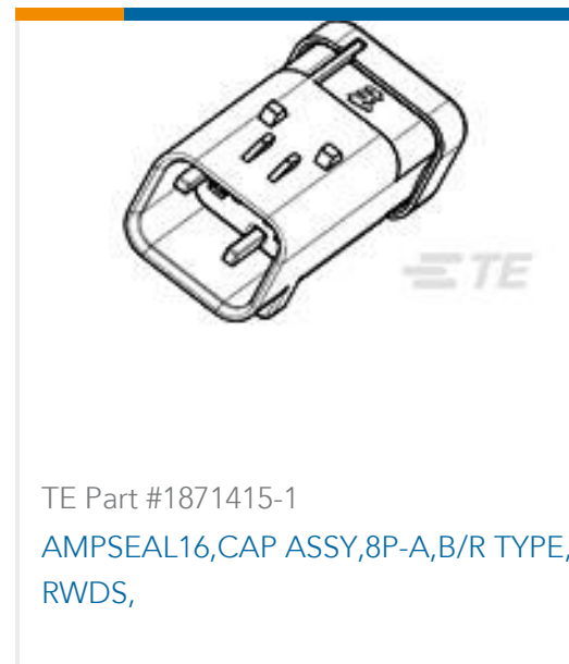
TE Part #1871415-1 AMPSEAL16,CAP ASSY,8P-A,B/R TYPE, RWDS,