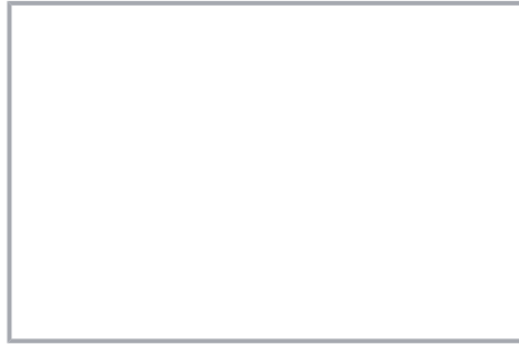
Push-in termination of solid and ferruled conductors