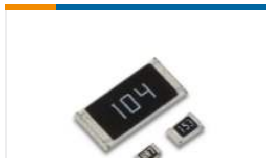
TE Part #2176345-9 CRGCQ 1210 47R 1%