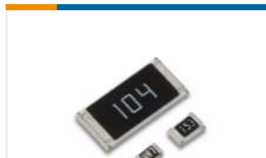
TE Part #2-2176345-3 CRGCQ 1210 680R 1%