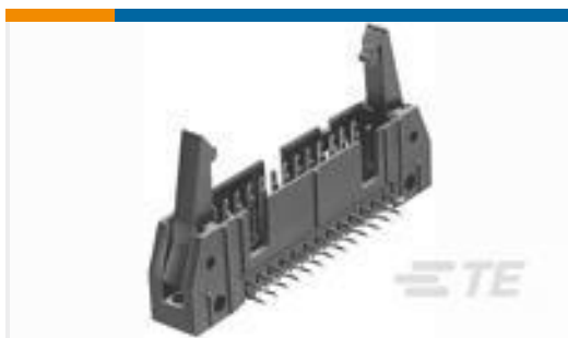
TE Part #5499913-2 A/L UNIV HDR 14P RA SHT LAT