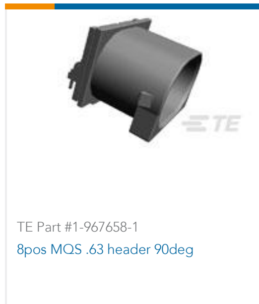
TE Part #1-967658-1 8pos MQS .63 header 90deg