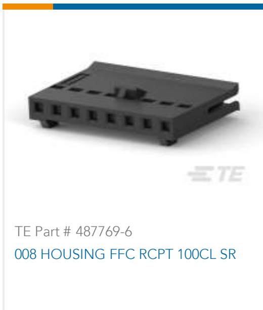
TE Part # 487769-6 008 HOUSING FFC RCPT 100CL SR