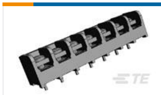
TE Part #1437653-7 6PCV-07-006=6PCV ASSEMBLY