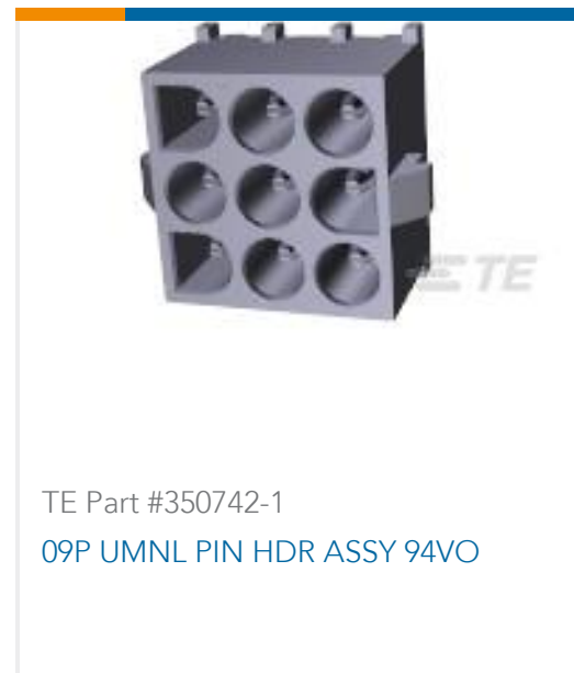
TE Part #350742-1 09P UMNL PIN HDR ASSY 94VO