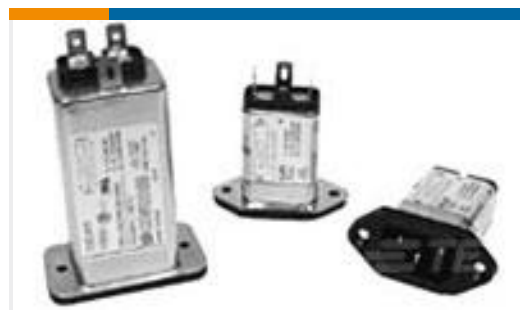
TE Part #6609064-2 3EOP=F7688A S0