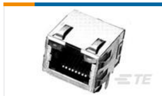
TE Part #2-406549-4 IMJ,1X1,PNL GRD,LED(Y/G), S