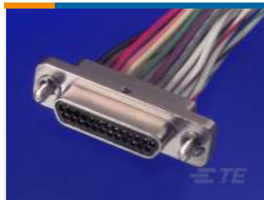
TE Part #1532179-7 M83513/03-A11N, MCKS-N1-B-9P6Q9-18.0