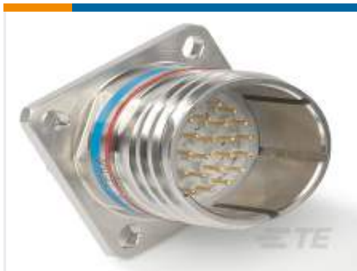
TE Part #YDTS20F25-35PAV001 RECP ASSY