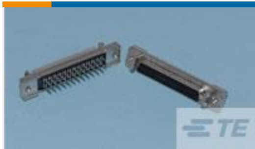
TE Part #5786554-9 100 50SR VRT RCPT,L,R,ACT PIN