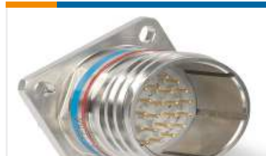
TE Part #YDTS20G25-35BNV001 RECP ASSY