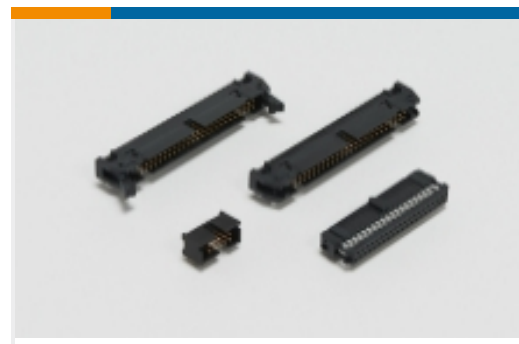
Ribbon Cable Connectors(34)