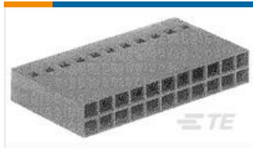
TE Part #1-104482-1 26 SHORT PT RCPT HSG DR .100CL