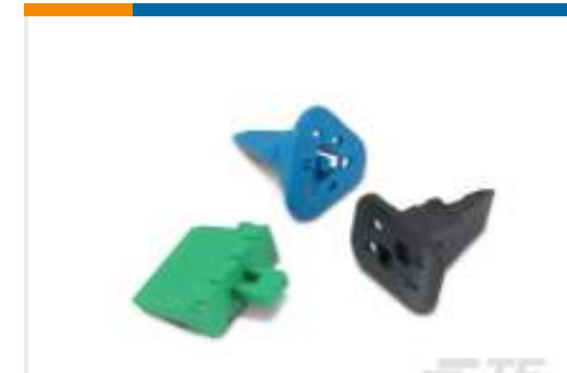
TE Part #W2P Wedge locks: DEUTSCH DT