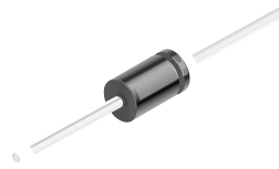
DO-35 Color Band Denotes Cathode