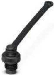
M8 sealing cap made of plastic with fixing band, for free M8 sockets, with 3.0 mm fastening eye

Please be informed that the data shown in this PDF Document is generated from our Online Catalog. Please find the complete data in the user's documentation. Our General Terms of Use for Downloads are valid ( http://download.phoenixcontact.com )