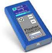
Flasher Portable PLUS

Flasher Portable PLUS is delivered with the following components: