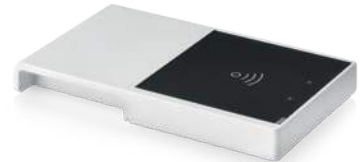
ID CPR30pro / ID CPR30pro SAM