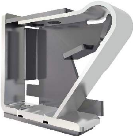
Solid PUSH IN contact Safe and durable