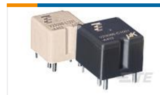
TE Part #1393280-5 V23086C1001A402