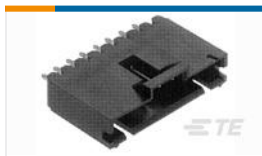
TE Part #5-103639-5 06 MTE HDR SRST LATCH .100CL