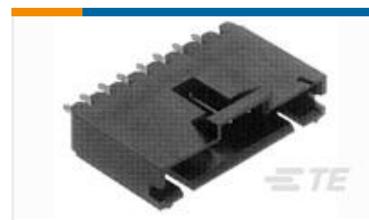
TE Part #5-103639-1 02 MTE HDR SRST LATCH .100CL