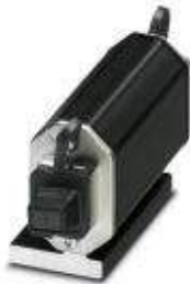
Multi-port data coupling: for passive PROFINET cabling to robots, including mounting foot

Please be informed that the data shown in this PDF Document is generated from our Online Catalog. Please find the complete data in the user's documentation. Our General Terms of Use for Downloads are valid ( http://download.phoenixcontact.com )