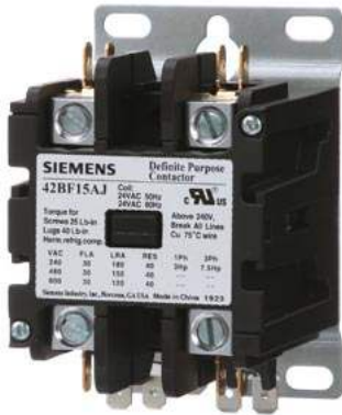
Contactor, 42DP,30A,2P,Open,24V Contactor, 42DP,30A,2P,Open,24V