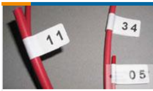
TE Part #C32547-000 NC-191064-10-9