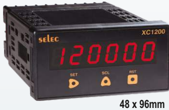
48 x 96mm