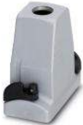
HEAVYCON ADVANCE EMV sleeve housing B10, with bayonet locking, height 100 mm, with 1x M25 thread, straight cable outlet

Please be informed that the data shown in this PDF Document is generated from our Online Catalog. Please find the complete data in the user's documentation. Our General Terms of Use for Downloads are valid ( http://download.phoenixcontact.com )