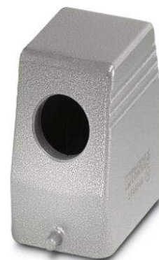
Figure shows product variant with thread.

http://eshop.phoenixcontact.de/phoenix/treeViewClick.do?UID=1677762