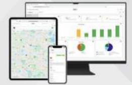
Manage this device with Digi Remote Manager