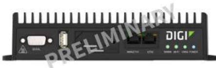
DIGI TX40 — FRONT