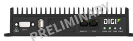
DIGI TX40 — FRONT WITH SIM COVER