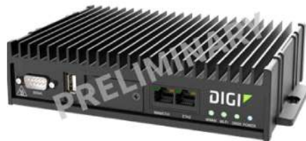
DIGI TX40 — FRONT WITH SIM COVER