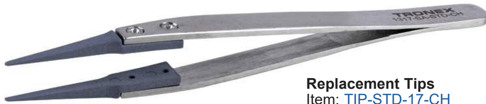
Replacement Tips Item: TIP-STD-17-CH