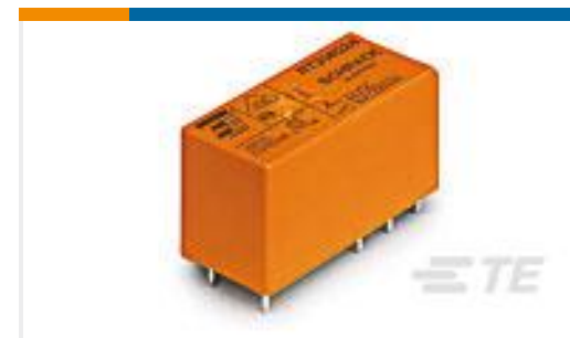
TE Part #1415898-2 RTS3TA12