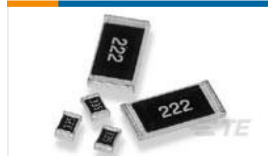
TE Part #1623402-1 CRG1206 1% 100K