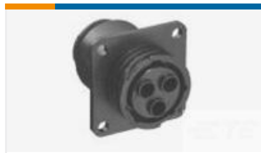
TE Part #788189-1 CPC 17-3 RCPT ASY, REV SEX