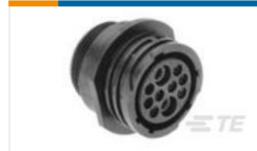
TE Part #213893-1 CPC RCPT, FLNGE MNT, SRS 6, 17-10