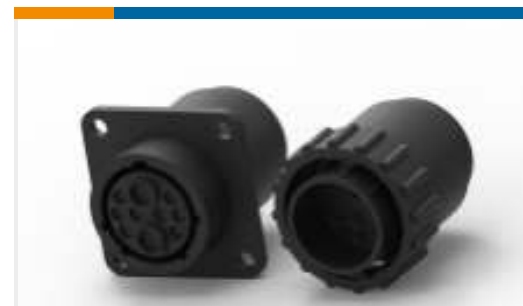
TE Part #1977892-1 Sealed Two-Piece Connector, CPC Series 6