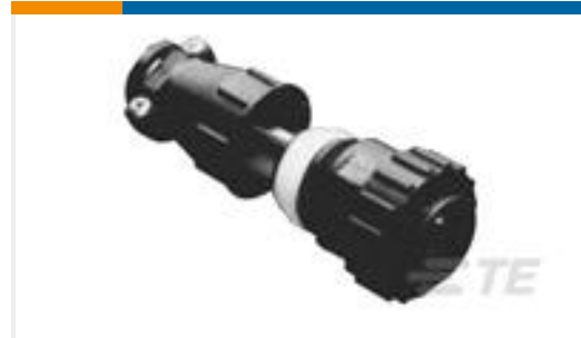
TE Part #213890-2 CPC RCPT SEALED SIZE 17-3