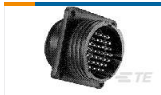
TE Part #213864-1 23-37 RCPT HSG, REV SEX, CPC