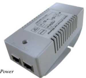
TP-POE-HP High Power