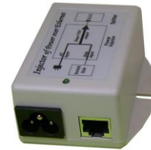
TP-POE Medium Power