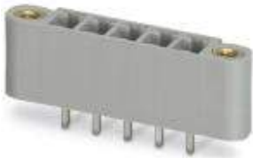
The figure shows the 5-pos. version of the product in gray

Header, Nominal current: 8 A, Rated voltage (III/2): 160 V, Number of positions: 6, Pitch: 3.81 mm, Color: black, Contact surface: Tin, Mounting: Wave soldering