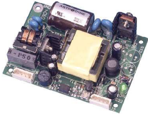
3"W x 2.18"L x 0.93"H