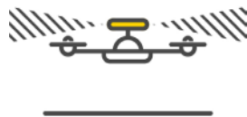
Drone obstacle avoidance