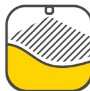
Level monitoring (silos, containers, etc.)