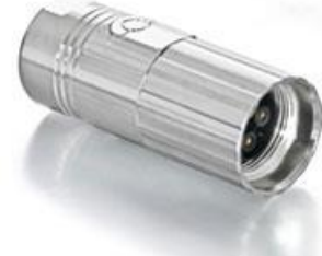
Contact Arrangement mating view

B ST A 906 NN 00 87 201A 000 B S A 906 N 00 87 201A 000