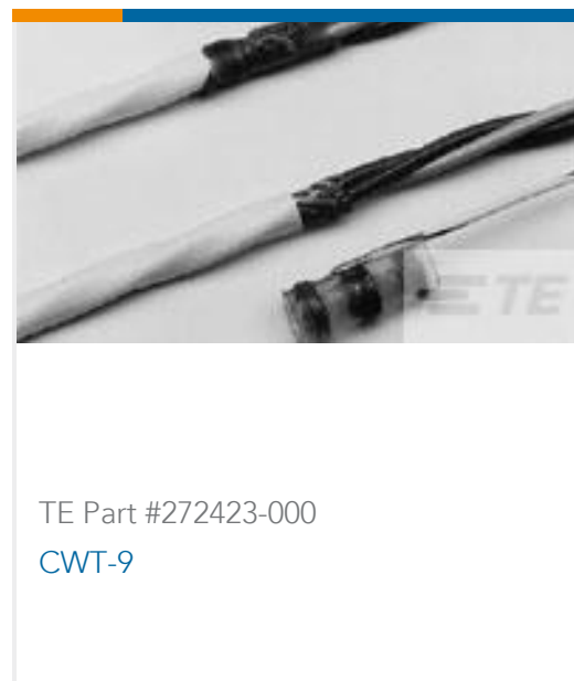
TE Part #272423-000 CWT-9