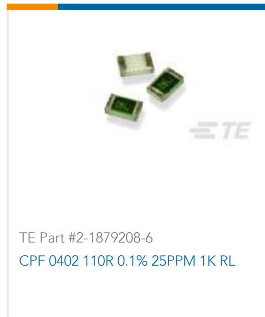
TE Part #2-1879208-6 CPF 0402 110R 0.1% 25PPM 1K RL