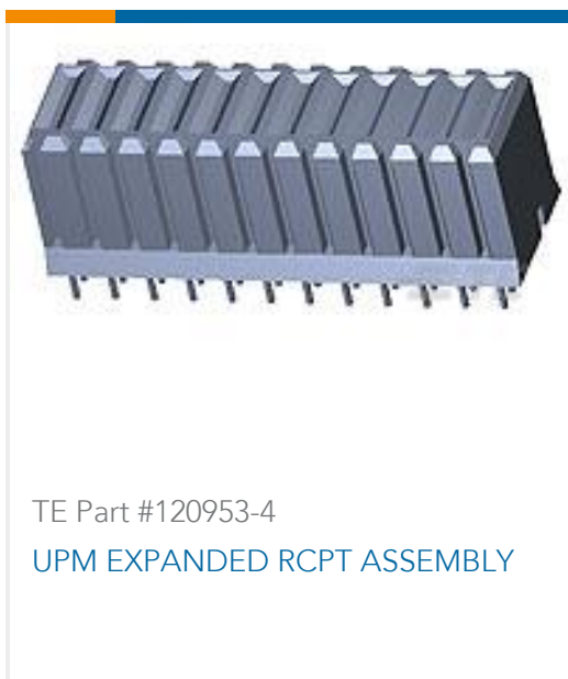
TE Part #120953-4 UPM EXPANDED RCPT ASSEMBLY