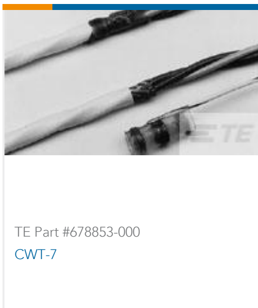
TE Part #678853-000 CWT-7