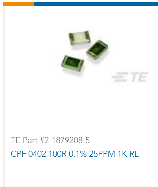
TE Part #2-1879208-5 CPF 0402 100R 0.1% 25PPM 1K RL