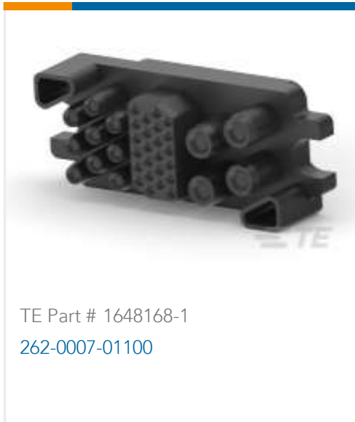
TE Part # 1648168-1 262-0007-01100