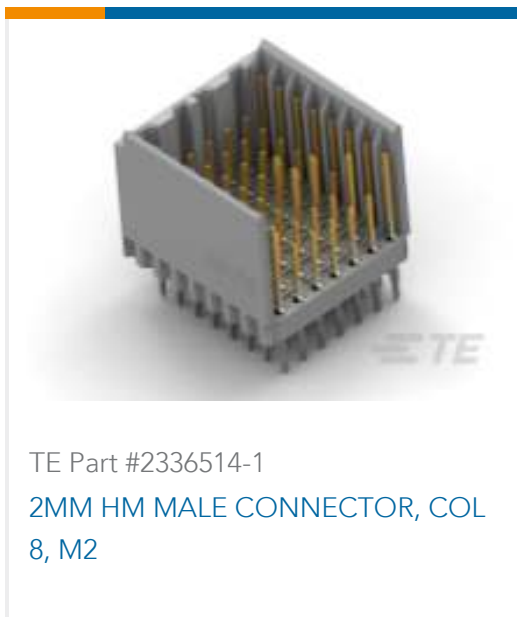
TE Part #2336514-1 2MM HM MALE CONNECTOR, COL 8, M2