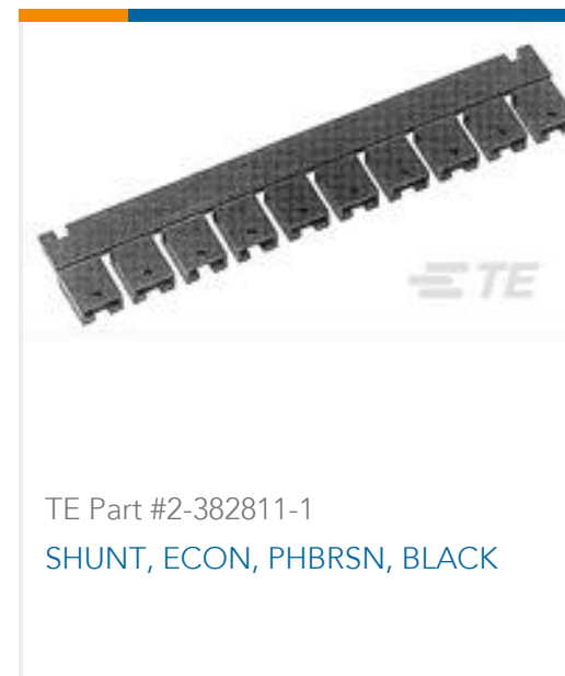
TE Part #2-382811-1 SHUNT, ECON, PHBRSN, BLACK