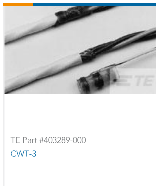
TE Part #403289-000 CWT-3