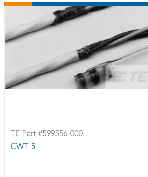
TE Part #599556-000 CWT-5