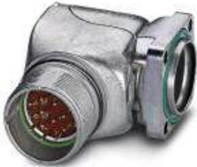
The figure shows the 12-pos. product version

Device connector, front mounting, angled fixed, Screw locking, M23, Number of positions: 17, Type of contact: Male connector, Crimp connection, Axial O-ring, 4xØ3,2, Shielded: Yes, Flange dimensions: 26 mm x 26 mm