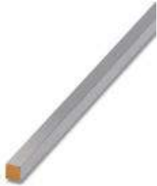
PEN conductor busbar, 6x6 mm, length: 1000 mm

Please be informed that the data shown in this PDF Document is generated from our Online Catalog. Please find the complete data in the user's documentation. Our General Terms of Use for Downloads are valid ( http://phoenixcontact.com/download )