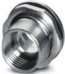
Housing screw connection, SocketLink:M12, Rear mounting, M15 x 1

Please be informed that the data shown in this PDF Document is generated from our Online Catalog. Please find the complete data in the user's documentation. Our General Terms of Use for Downloads are valid ( http://phoenixcontact.com/download )