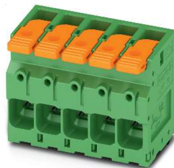
The figure shows a 5-position version

PCB terminal block, Lever Push-in connection