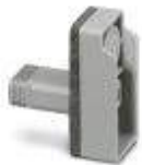
Sealing plate, Color: gray