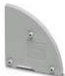
Spacer plate, Color: gray